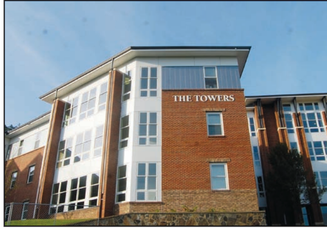
The Joint Development Authority of Fannin, Towns and Union counties have approved bond financing for YHC's new residence hall, The Towers.