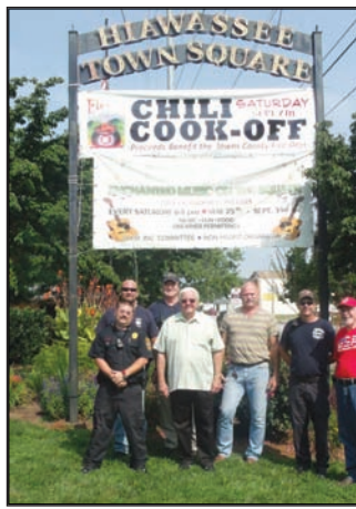
The Fire in the Mountains Chili Cook-Off returns to Hiawassee Sept. 7th.

The Cook-Off, scheduled for Sept. 7th, is an event many