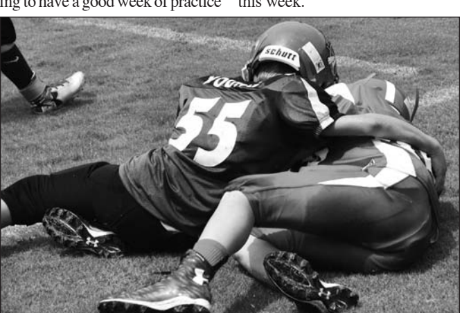
A young Indian makes a tackle in a recent game.

"The Pee Wees, we're going to have a good week of practice