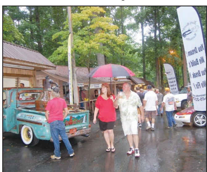
Left, rain or shine, the CruizIn was wide open from the word go. Right, patrons got an upclose looks at the Classics.