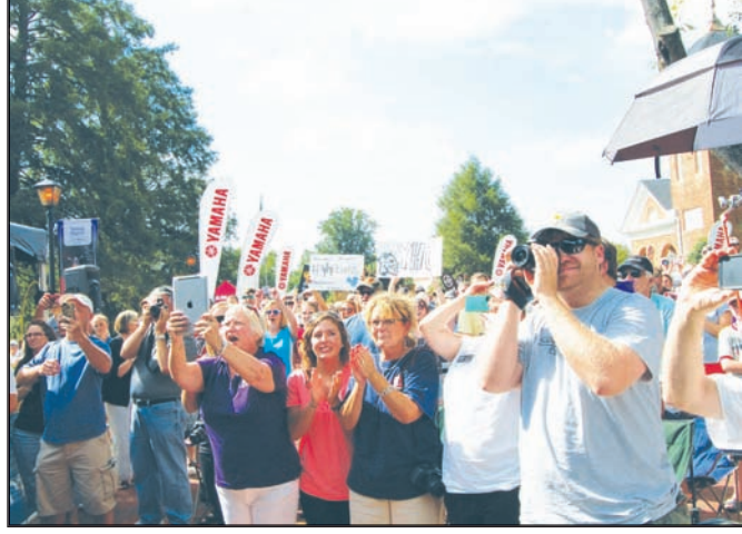
Fans (tourists) root for the home team, Young Harris College, during the Carhardt Bassmasters Championships.