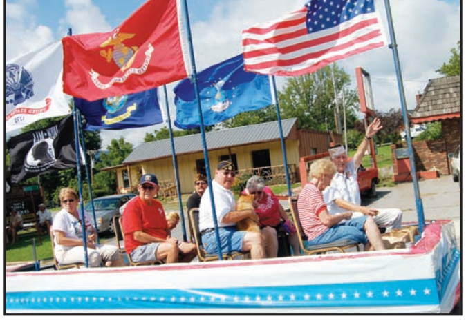
Towns County honored their WWII vets by naming them Grand Marshals for Saturday's annual Georgia Mountain Fair Parade in Downtown Hiawassee.