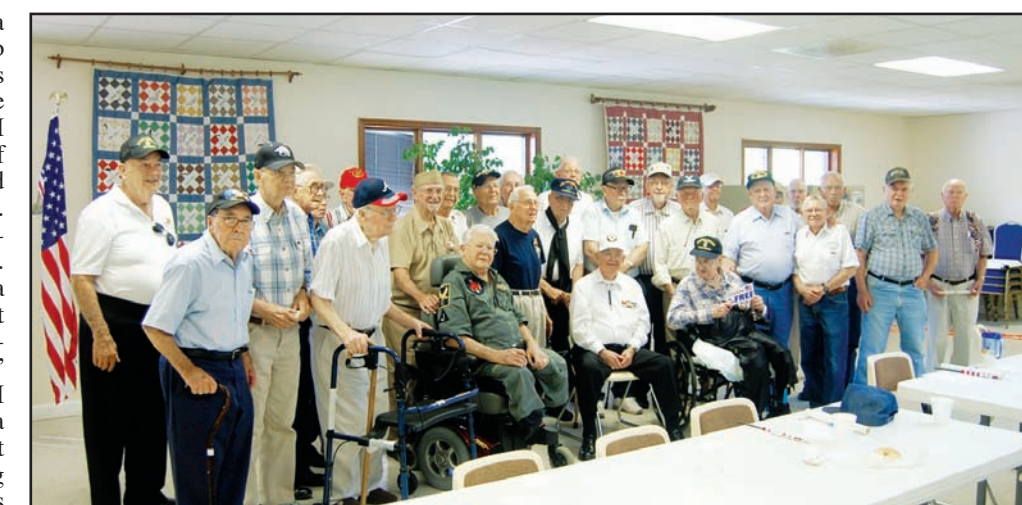
These 26 Towns County veterans were named Grand Marshals of the 62nd Annual Georgia Mountain Fair Parade.

"We thank you for your service to this great nation of