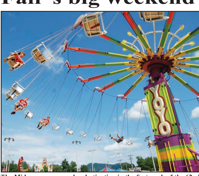
The Midway was a popular destination in the first week of the 62nd Annual Georgia Mountain Fair.