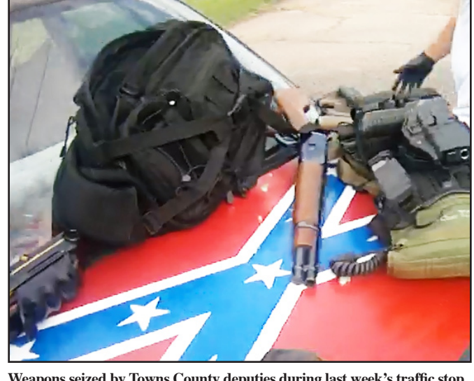
Weapons seized by Towns County deputies during last week's traffic stop.

Rather than comply with deputies, Gunnells reached for