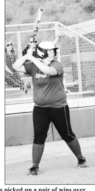
Union County and Fannin County's JV squads on Tuesday.