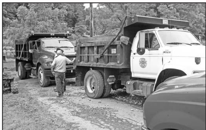
County road crews were busy over the holiday weekend.