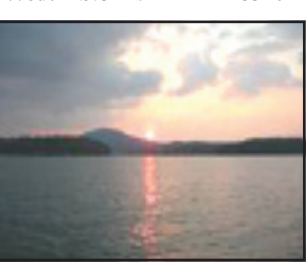
Upstream Elevation Predicted 07/09/2014

Thu: T-Storms Fri: T-Storms 86 62 88 63 Sat: T-Storms 88 65 Sun: T-Storms Mon: T-Storms 83 63 Tue: T-Storms Wed: T-Storms