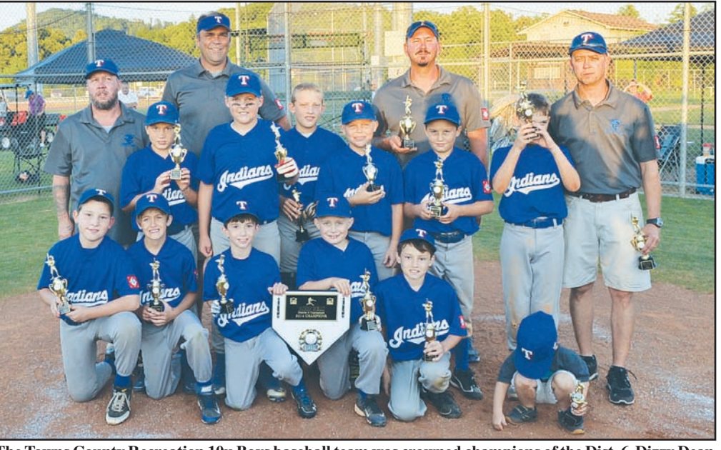
The Towns County Recreation 10u Boys baseball team was crowned champions of the Dist. 6 Dizzy Dean Tournament held at Union County's Meeks Park. See Baseball , page 11