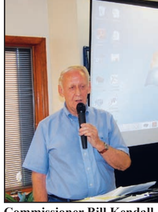
Commissioner Bill Kendall

Kendall recapped the exemptions of the bill as well as the tax increases on every day consumer items.