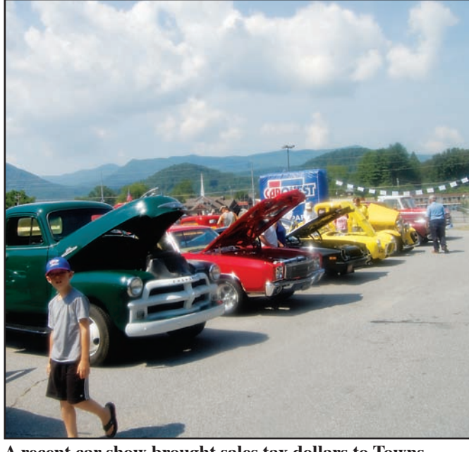
A recent car show brought sales tax dollars to Towns.

Members of the Ford group traveled from all across the United States, including Louisiana, Virginia, Maine, Illinois, Missouri, New York,