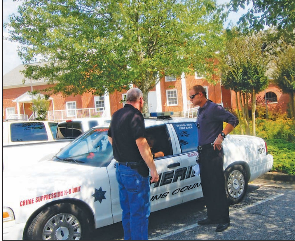
Local and state authorities discuss details about last week's bank robbery at Citizens South Bank. The suspect remained at large at press time.

By Charles Duncan Towns County Herald cduncan.tch@windstream.net