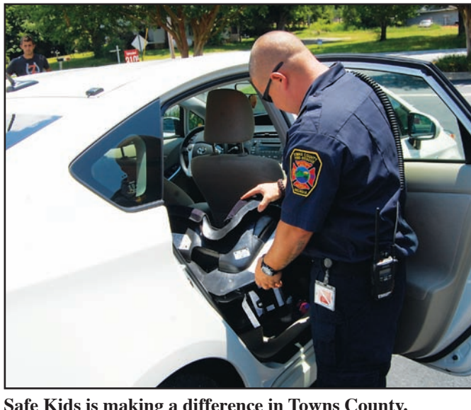
Safe Kids is making a difference in Towns County.