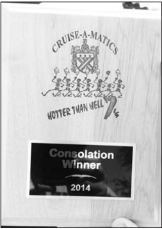
Above: The BRMRFC's first piece of hardware following the Columbus Tournament. Left: The seven team members who traveled to Columbus last month to take part in the 7's tournament. They are attemting to host their own local tournament sometime later this summer but will be keeping busy in the coming weeks.

meters for the score. We really pulled together as a team and this is just the beginning for the club.