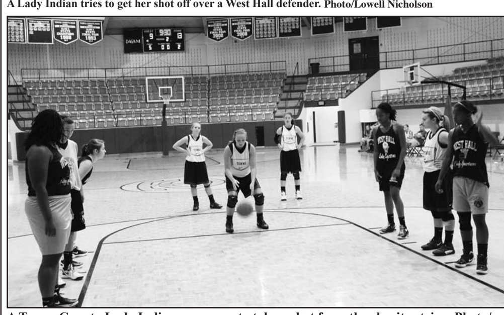
A Towns County Lady Indians prepares to take a shot from the charity stripe.