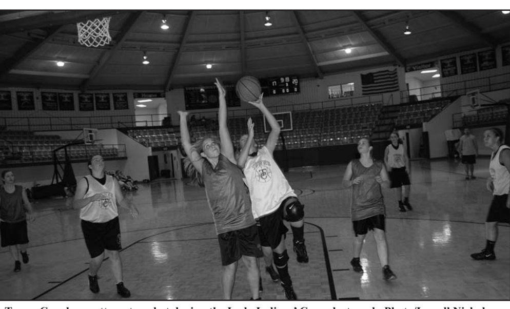
A Towns Co. player attempts a shot during the Lady Indians' Camp last week.

continue perfecting their skills Melton. "Most all of the girls work on their game yearround in some shape or form. whether it is shooting baskets the gym since the last game of and ball handling or lifting and