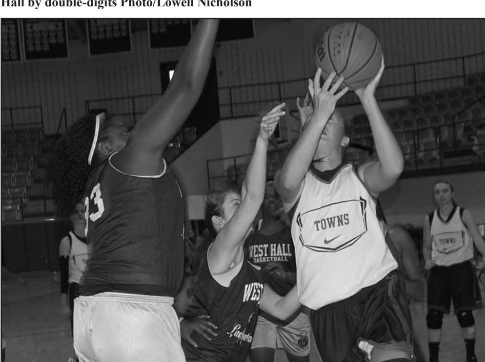
A Lady Indian tries to get her shot off over a West Hall defender.

The Towns County Recreation Department is always interested in beginning new programs and classes. If you have a special talent and are willing to instruct and teach others your skills, we would be delighted to talk with you about offering such a program to interested people through the recreation department please call us at (706) 896-2600.