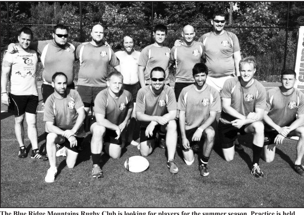
The Blue Ridge Mountains Rugby Club is looking for players for the summer season. Practice is held in Blairsville with players from Towns, Union, and Hayesville, NC. More info is available on Facebook under Blue Ridge Mountains Rugby Club.

for the Blue Ridge Mountains Rugby Club is just beginning.