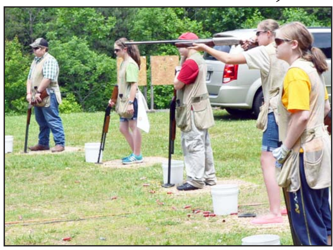
Youthful shooters put on a show at the Sixth Annual Trap Shoot to raise money for the Georgia Sheriff's Association Youth Homes.

big part of the event as they conditions for the shoot.