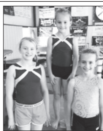
MGC Level 2