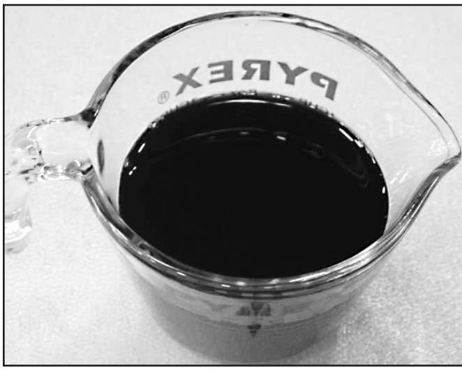
Balsamic vinegar is dark and rich

Vinegar in the kitchen, the body, and the garden