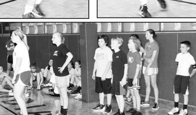
Towns County Basketball Camp