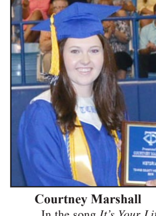
In the song It's Your Life

I have no doubt that we are well prepared for the next phase of our lives.