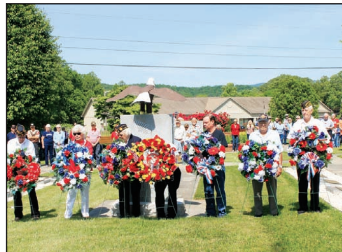
The Laying of Wreaths ceremony at Veterans Memorial Park on Monday morning.