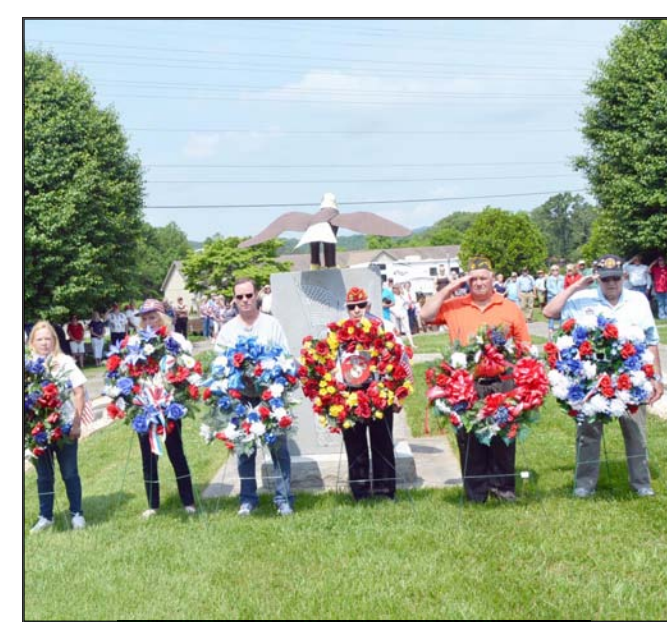
Laying of the Wreaths at Towns County Veterans Memorial Park.