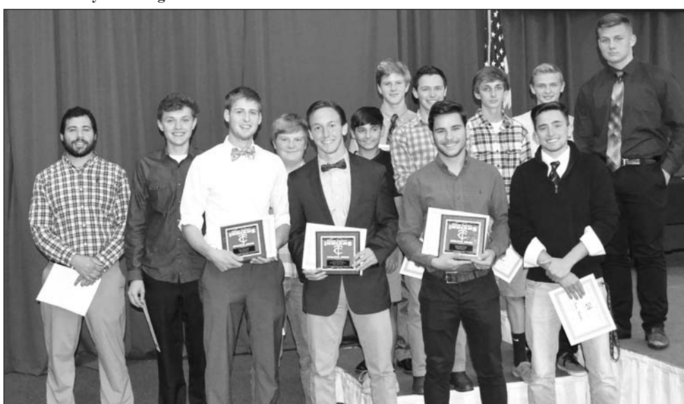
Towns County boys soccer.