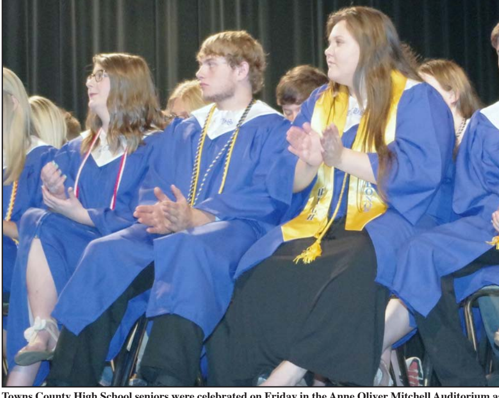
Towns County High School seniors were celebrated on Friday in the Anne Oliver Mitchell Auditorium as they prepare for their last rites of school - the Class of 2016 graduation.