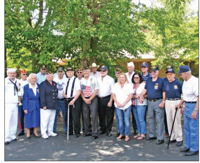
The first annual Defenders of Freedom Day at The Ridges Resort & Marina was on Saturday.