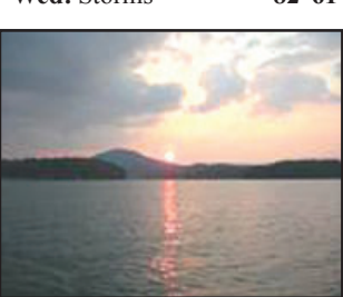
Upstream Elevation Predicted 05/23/12

Thur: Cloudy Fri: Sunny 85 60 89 63 Sat: Sunny 88 64 Sun: Sunny Mon: Cloudy 85 62 Tue: Storms 83 63 Wed: Storms