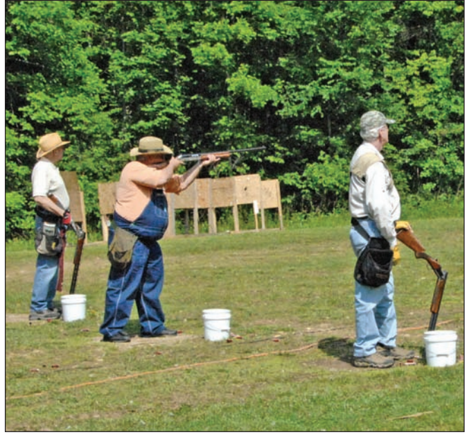
Participants in the 2012 Sheriff's Trap Shoot were shooting for a righteous cause on Friday.