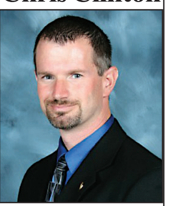
Seeks reelection See Page 2A