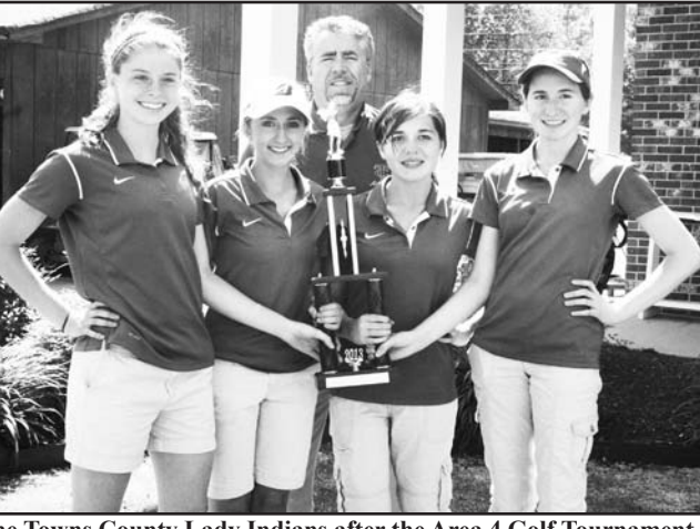
The Towns County Lady Indians after the Area 4 Golf Tournament in Fort Oglethorpe last month.

Be sure to pick up a copy of next week's edition of the Towns County Herald for Joe Collins' full report on the Lady Patton fired a 47 on the Indians strong showing in Roy-