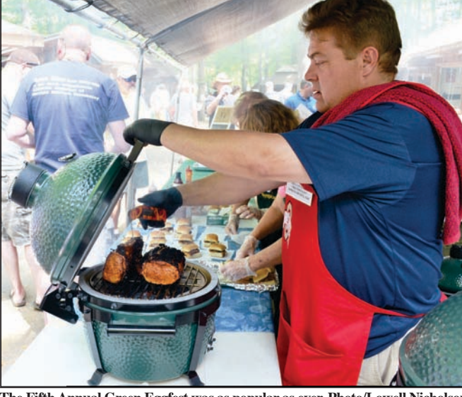
The Fifth Annual Green Eggfest was as popular as ever.