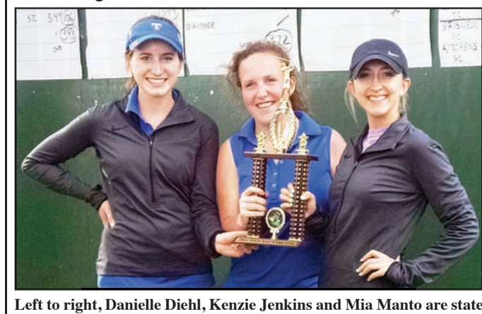
champions. The trio claimed a state title by three strokes in Royston.