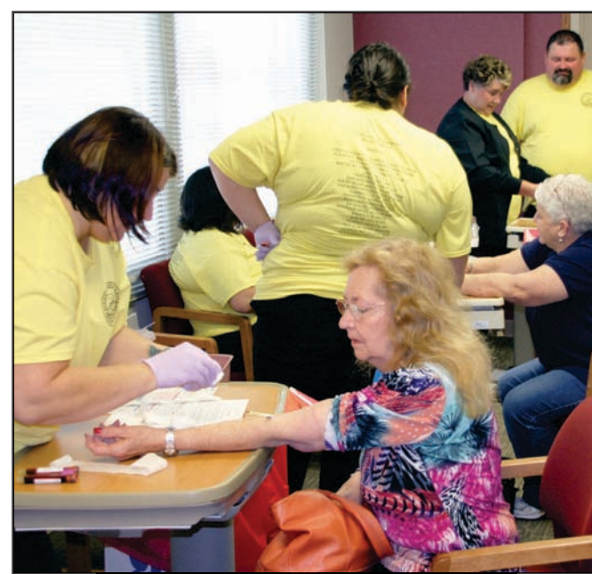
The 2015 Health Fair was a hit at Chatuge Regional Hospital.