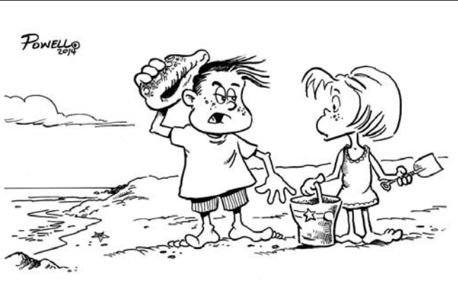
"All I hear are babies crying on another political ad!"