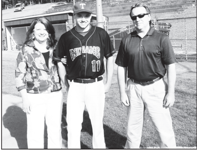
Towns County High School baseball honored its senior players and managers at last week's Senior Night.