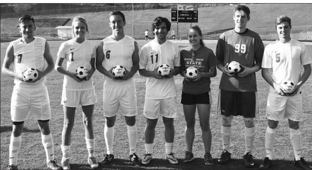
Towns County honored its senior soccer players last week.