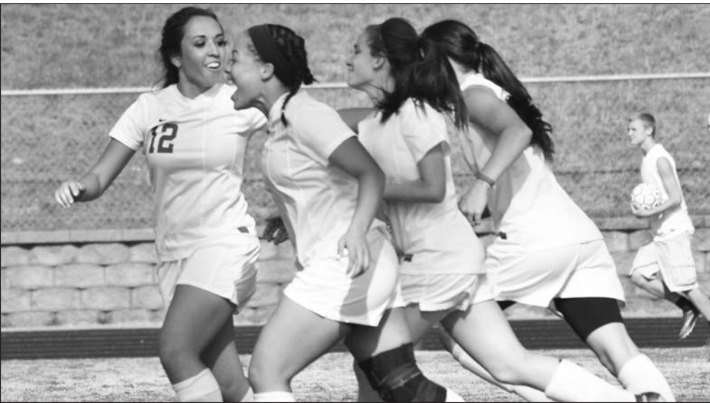
Towns County soccer