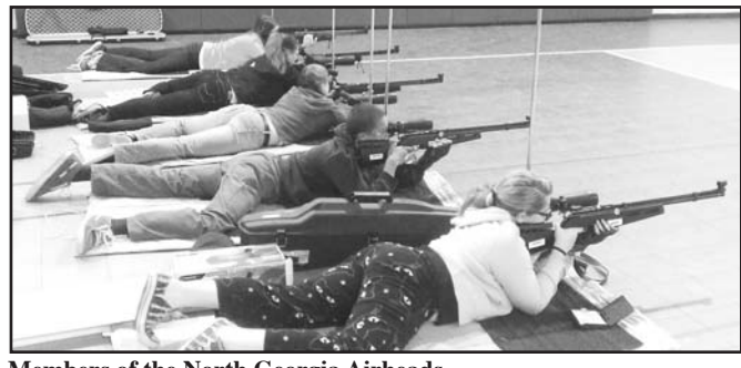
Members of the North Georgia Airheads

The Airheads are shooting in the Sporter Rifle class.