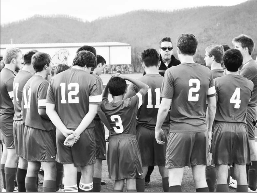
The Indians soccer team during halftime of their 1-1 tie at Union County last month.