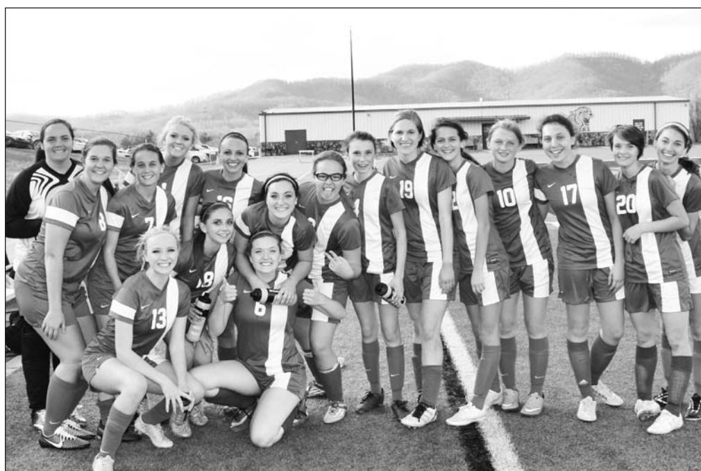
The Towns County Lady Indians soccer team after their win at Union County. (Right) The Indians during an early season game vs Fannin County.

Another consideration that must be taken into ac-