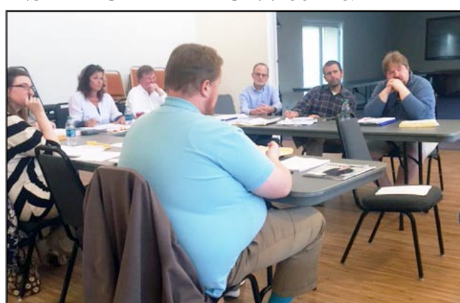
The Young Harris City Council heard updates on several of its ongoing projects during its regularly scheduled meeting on Tuesday, April 5