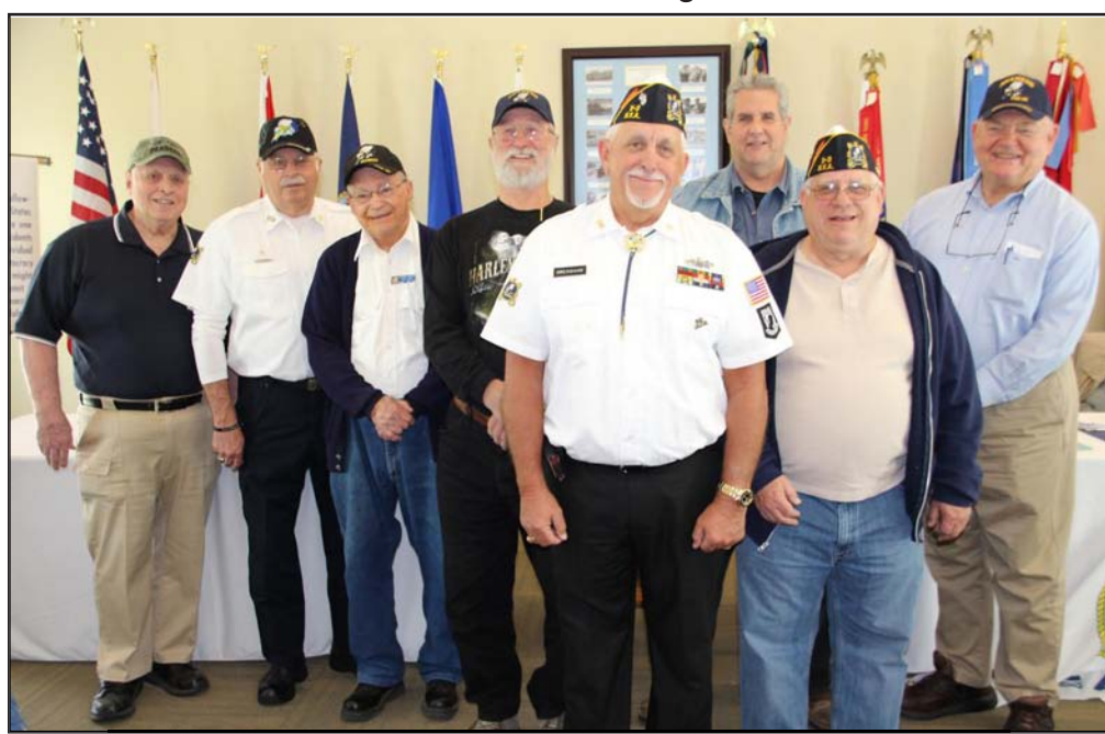
2016 officers after having been sworn in at the April 8 meeting of the Seabee Island X-3.

"Our first meeting we had on April 10 of last year we had 17 members, so that was a highlight. The other highlight