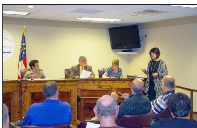
At its regularly scheduled meeting on Tuesday, April 5, the Hiawassee City Council heard a number of presentations.

"The city's marketing dollars have been used for print ads in Southern Living Magazine , Georgia Great Places , which is the Georgia State Parks Magazine , and in print, Smoky Mountain Living Magazine , Southern Travel and Lifestyle Magazine , USA News and Georgia Travel Guide , which is a state piece. Every