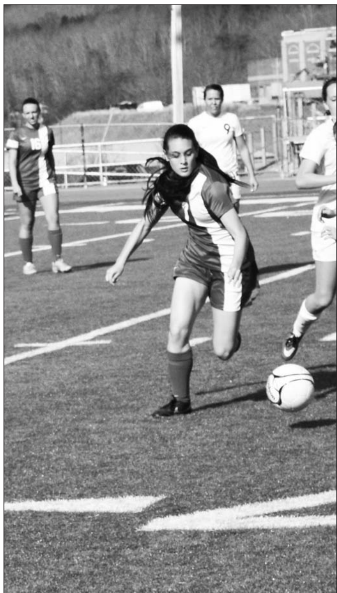
Towns County Lady Indians Soccer

Just as the boys game was getting underway, the rain began. Heading into the halftime, the Indians were down 2-0 to the Storm, but the rain proved to