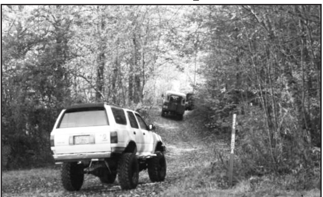
OHV enthusiasts start on a designated trail on the Chattahoochee Oconee National Forests

As a sure sign of spring, all off highway vehicle (OHV) trails across the national forest have reopened, many with new improvements. Within the national forest, OHV trails are specifically designated and signed to increase public safety and minimize potential forest damage.