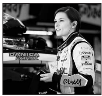
Danica Patrick, driver of the No. 10 Stewart-Haas Chevrolet

Meanwhile Kyle Larson has been cleared to race