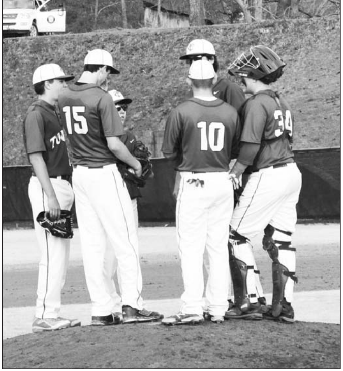
TCHS baseball