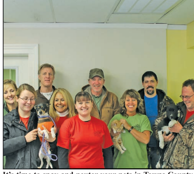
It's time to spay and neuter your pets in Towns County if that's what they need.