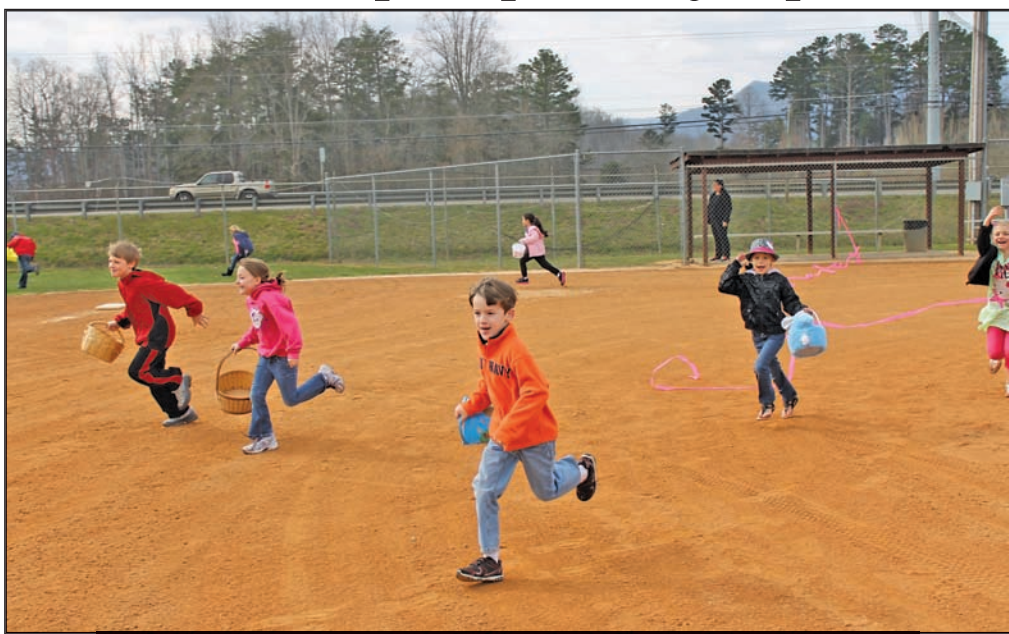
Towns County youth make off in a mad dash for Easter Eggs and prizes at the annual Towns County Parks and