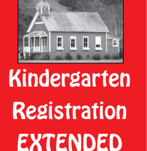
See page 2