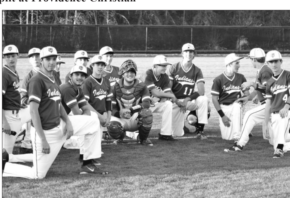
Towns County following their come-from-behind victory over Lakeview on Friday.

On Tuesday, Towns County visited Providence for an 8-A doubleheader and forced the split with a drubbing in game two.