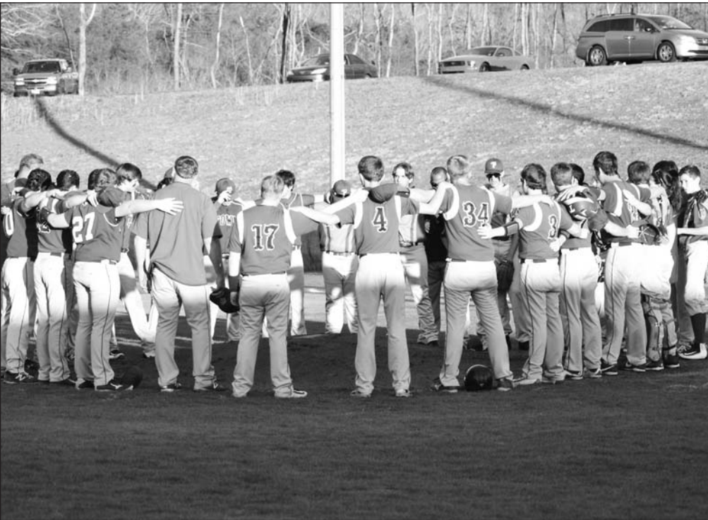
In a display of sportsmanship, the Towns County Indians and Tallulah Falls gather following Towns win on Tuesday. The Indians fell later in the week to Class AAAA's Pickens County and dropped two to Hebron Christian Academy on Friday.