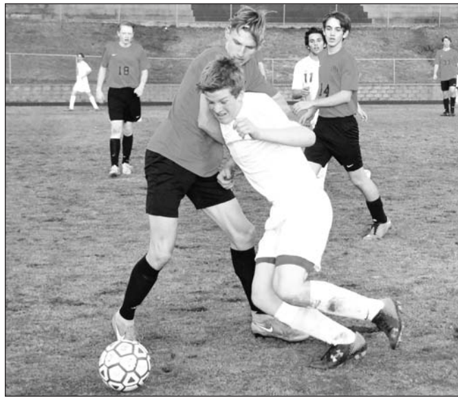
Towns County soccer vs George Walton.