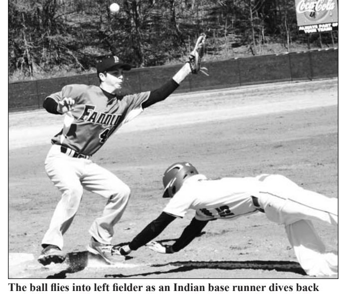
into third base.

This is where the trouble started for Towns County. The Rebels capitalized on a pitching change that occurred during the sixth inning, scoring 5 runs in the seventh to bring up a 9-5 score against the Indians with half an inning left in the