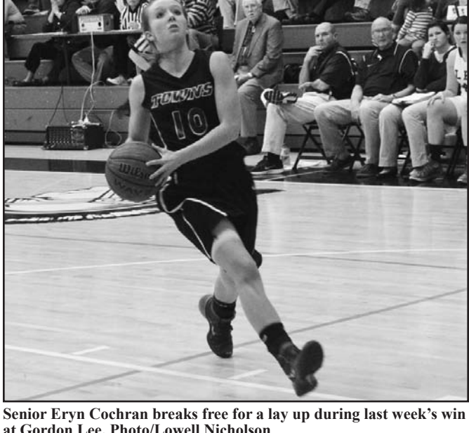
at Gordon Lee.

The Lady Trojans entered the game with a 19-7 record with four of the losses coming at the hands of teams winning 20 or more games, two others to teams winning 19 games, and the other to a team winning 17. Further, three of the losses came at the hands of Class AAA and AAAA teams and the other four were to private schools in their Region 6-A, easily considered the toughest Class