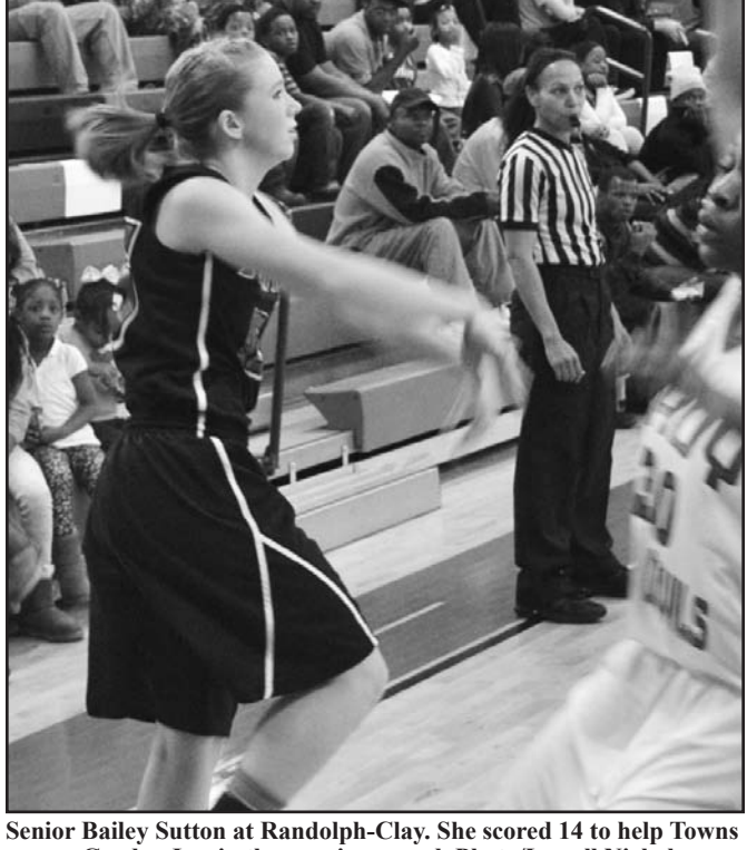
escape Gordon Lee in the opening round.

The Lady Devils opened the second quarter with two free throws and a three point play in less than a minute of playing time for a 22-6 lead but that would be the end