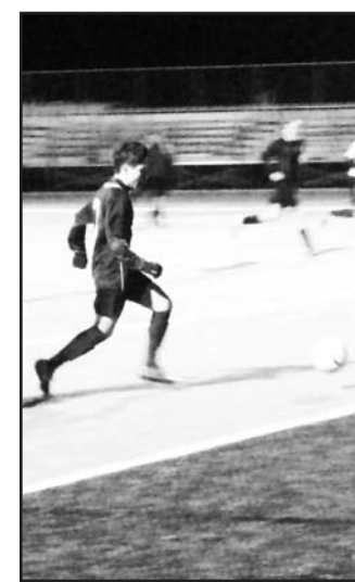
Indians in action at Union County.

hard as the second period was coming to a close. The officials, in agreement with both coaches called the game at the 74th minute, giving the Panthers the win.