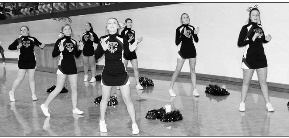
Towns County High School basketball cheerleaders.