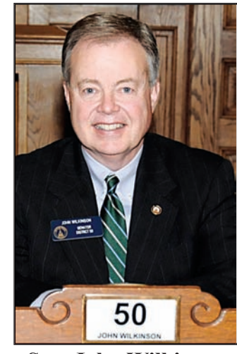
Sen. John Wilkinson

Also known as the supplemental budget, the plan includes no additional programs, but would add $245 million in needed Medicaid funding and $172 million to local school systems to address costs associated with enroll-