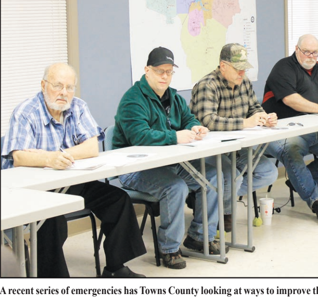
A recent series of emergencies has Towns County looking at ways to improve the county's emergency preparedness efforts.