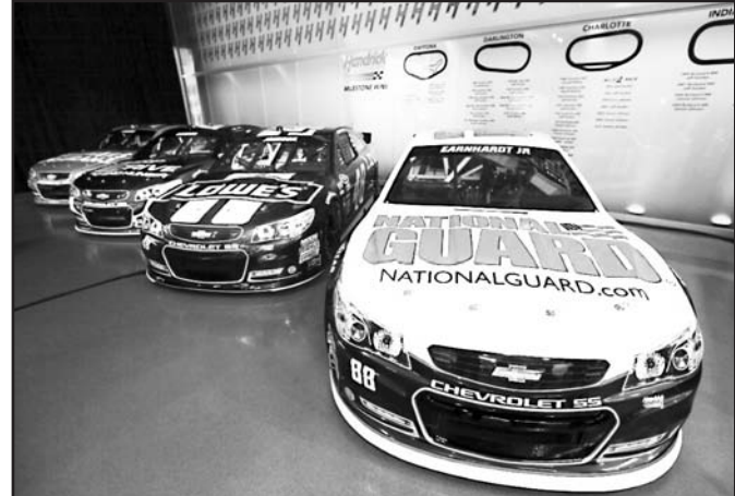
The new Gen-6 Chevrolets of Hendrick Motorsports.

"We made the COT car a really good race car. It took a while, but we did. Now I look at this (Gen-6) race car and see where we're starting out with this car -- and it feels good. It drives good, it's forgiving, and it's got a great aerodynamic balance. So far, I'm a big fan. I love it. I like what's happening underneath the car. I like the body style." That doesn't mean, however, that the transition to the new car will be easy. "Any time you start to get used to something and there's a change, it's a learning curve," Gordon continued. "In my opinion, the older you get in this sport, and the more you've been around, the harder it is to switch to new things. "There's going to be times, I think, that we're going to be challenged. But it seems like this car is going to be an improvement for everyone in the sport." There were also a lot of mixed signals during last week's Media Tour. In addition to all the positives about the new car, Hendrick Motorsports announced the No. 88 driven by Dale Earnhardt Jr. will enter the 2013 season with 13 unsponsored races. Rick Hendrick said there has been plenty of interest from sponsors and that he is more concerned with finding a match that will work beyond 2013. "We've got a lot of good opportunities," Hendrick said. "The way we're positioned, the car is covered until the end of the summer. I don't have a deadline [for a deal]. I'm not looking at a timeline. I'm looking at the right deal. "We are working on two or three deals, but we haven't