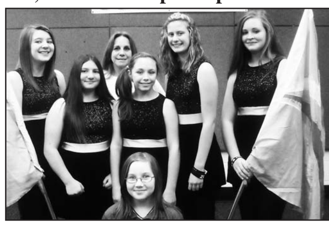
Towns County Color Guard members attend JanFest.

school band musicians from throughout north Georgia to participate in this All-Star Band. The All-District Band will rehearse February 7-9 and then present a 2 PM concert for the public at the Fannin Performing Arts Center on February 9th. Three Towns County High School band members were selected to perform in the University of Georgia's JanFest this past week. This group rehearsed with promi-