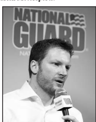
Dale Earnhardt Jr. talks to media on Jan. 23

put any line in the sand." Hendrick said his other three Cup cars are fully sponsored. He doesn't believe that the open inventory on Earnhardt's car is an indicator that the economy hasn't turned around. He noted that more Fortune 500 companies entered the sport over the past year than in 2008. "We have got the majority of the season with the Guard and then Diet Mountain Dew is going to back off a little bit, and that makes it a bit of a challenge to fill that small of a gap," said Earnhardt. "If it were a bit larger gap, it would be easier to fill." NASCAR HAS ITS OWN DATING GAME Danica Patrick revealed to the Associated Press that she and Ricky Stenhouse Jr. are a couple, ending widespread speculation about the nature of their relationship. "I have a boyfriend, his name is Richard," she said during a telephone interview with AP. The couple waited until the end of Charlotte Motor Speedway's weeklong annual media