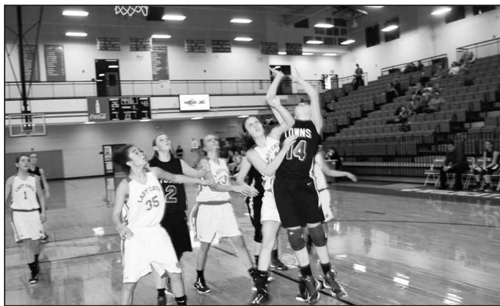
Lady Indians' JV in action during the third quarter of their game at Rabun.