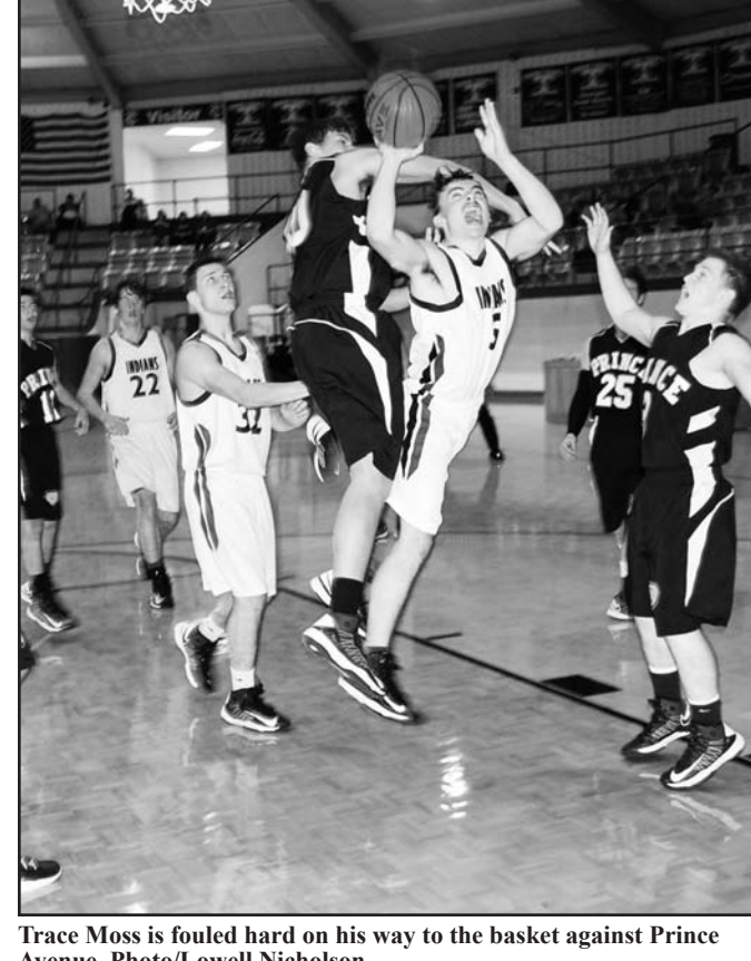
Avenue.