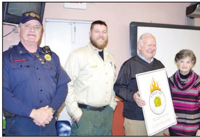
Fire Adapted, Firewise Communities

"What this represents is a cooperative effort within their community to do those things that are necessary to have them meet the criteria to become a Fire Adapted,