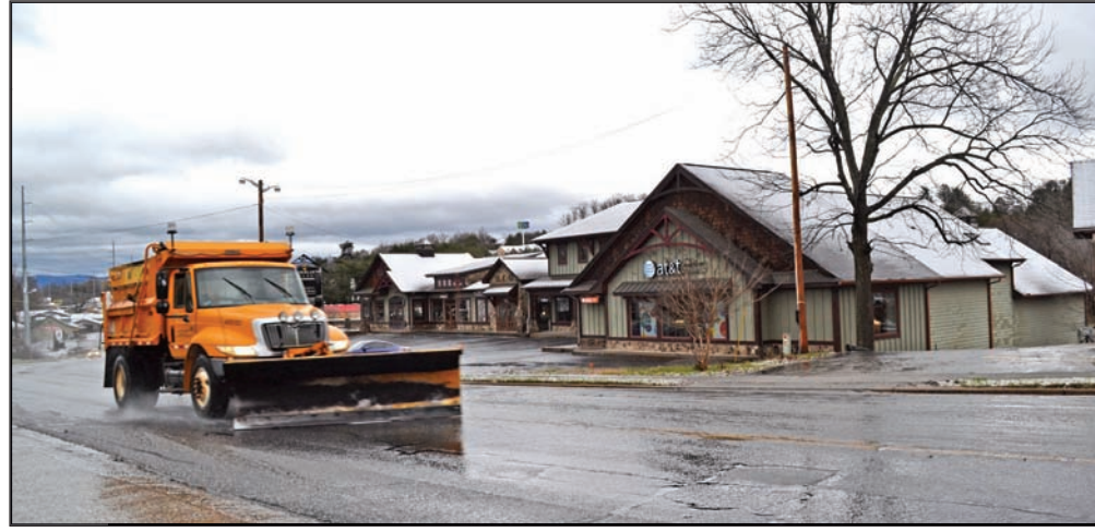
Georgia DOT hard at work during the winter storm