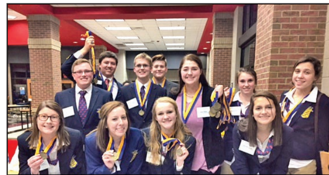
TCHS FBLA region winners show off their medals