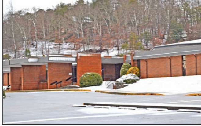
TC schools closed due to inclement weather