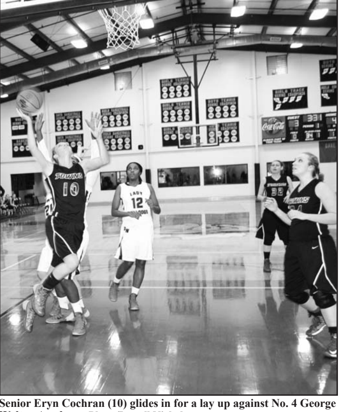
Walton Academy.

of the Lady Indian points in fourteen wins were one each