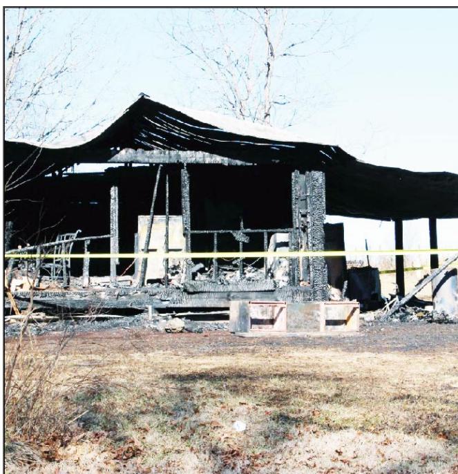
Fire at this Young Harris home displaced two people.

The couple in the residence escaped through the rear of the home with no injuries. No fire hydrant was close by, so a water shuttle was set up, providing water to extinguish the blaze and grass