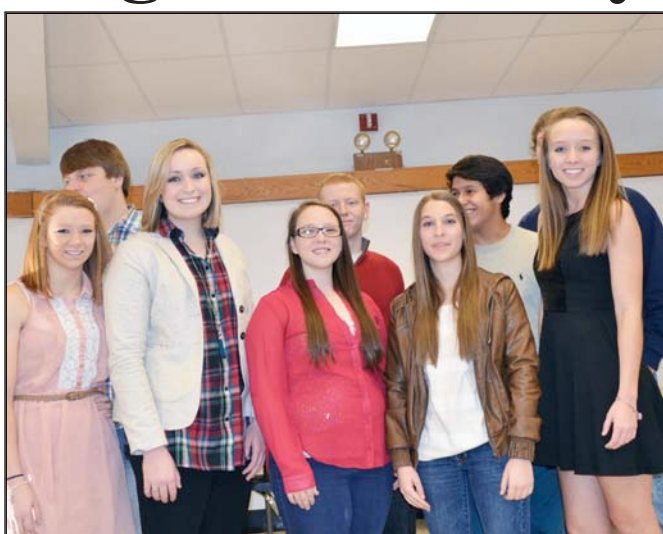
One of these lovely young ladies and handsome gentlemen will be named Homecoming King and Queen on Saturday.