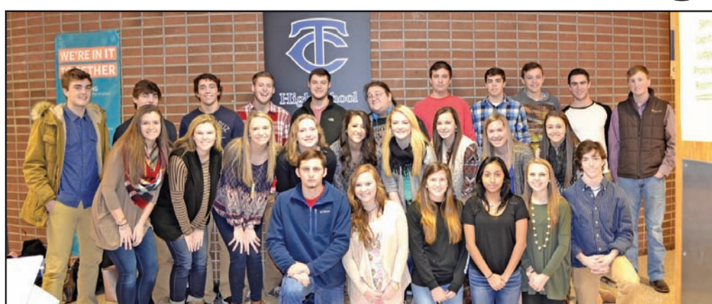
Towns County High School Homecoming nominees