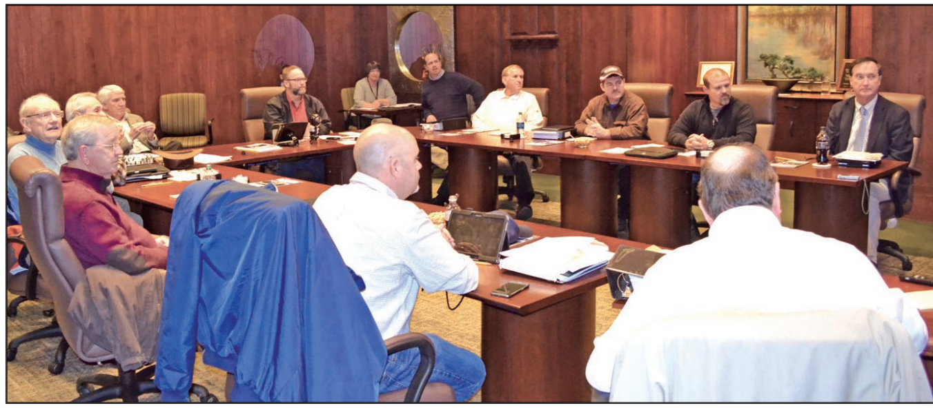
The Blue Ridge Mountain EMC Board of Directors entertain the media in a Question and Answer session before commencing the first meeting of the New Year in the BRMEMC boardroom

On Tuesday, Jan. 12, members of the news media were invited to the BRMEMC boardroom to ask direct questions of the board