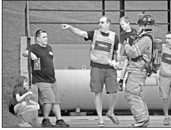
A recent drill conducted by Towns County EMA at the Georgia Mountain Fairgrounds.