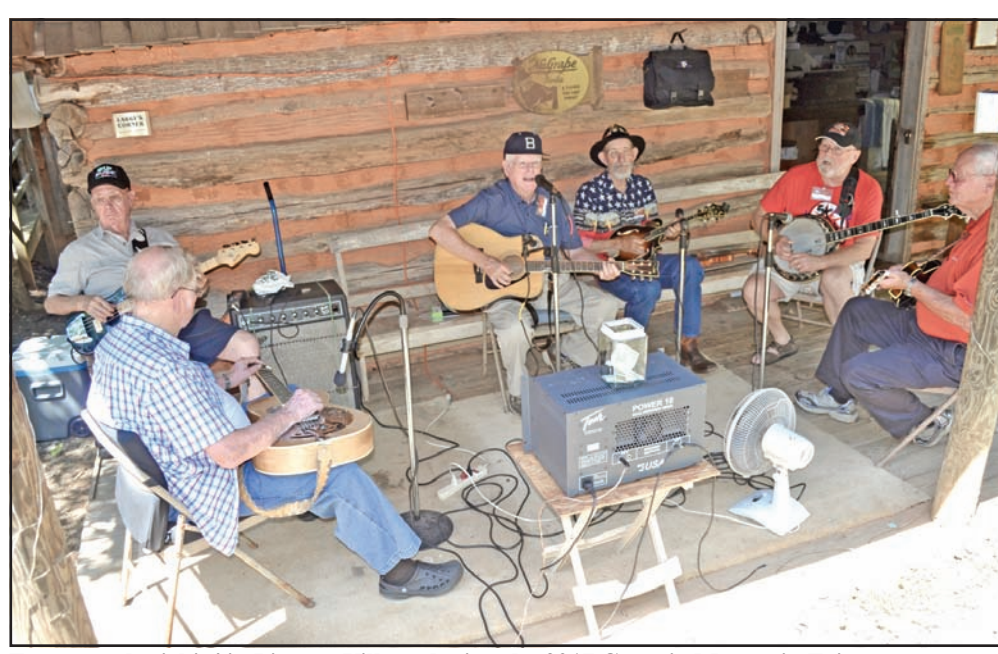
Front porch pickin' in Pioneer Village during the 2017 Georgia Mountain Fair.